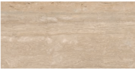
Veincut Beige 80x160 cm F86TRTBOYRO Lappato Matt F86TRTBOLRO Full Lappato

120x240 cm | 80x240 cm | 80x160 cm 120x120 cm | 60x120 cm