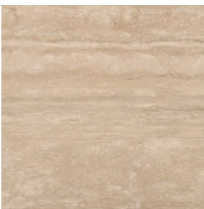
Veincut Beige 120x120 cm F12TRTBOYRO Lappato Matt F12TRTBOLRO Full Lappato