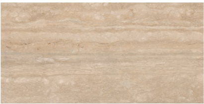
Veincut Beige 120x240 cm F14TRTBOYRO Lappato Matt F14TRTBOLRO Full Lappato