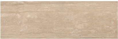
Veincut Beige 80x240 cm F84TRTBOYRO Lappato Matt F84TRTBOLRO Full Lappato